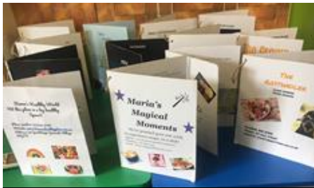
Rm 6 students designed their own Healthy Eating Restaurant menus.