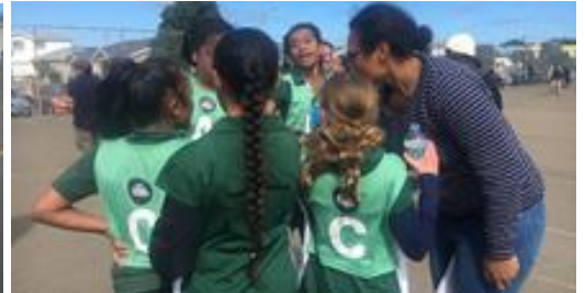
Thanks to everyone for a great netball season! Special thanks to our coaches and managers!