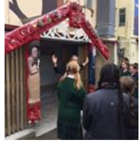
Challenge 2000 visit to Soup Kitchen:

(Photo below): Special thanks to the Challenge 2000 leaders for taking the group of children they were working with to the soup kitchen on Monday. Thanks also to Ms Wood (teacher) for accompanying them.