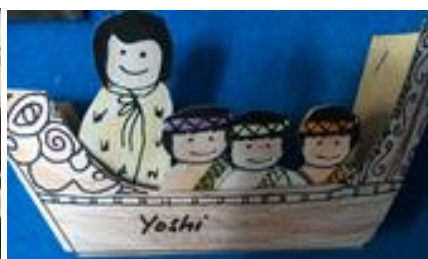
Talented artist in Room 2