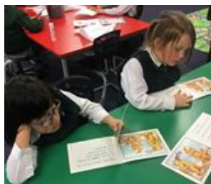
Fluent readers in Rm 1