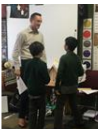
FLIP in action thanks to the team from PWC who are teaching our students about good financial literacy practice.