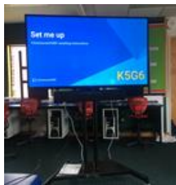
New multipurpose device from our library with chrome cast.

(R) Annabelle Rm 10, Yr 7: "Do we need the Royal Family?"