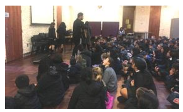
School wide Kapa Haka at Loaves and Fishes

St Mary's College Open day is on Thursday 14<sup>th</sup> June from 9.00-11.00am, 11.30am-1.30pm. Contact details: 04 473 5554 or email: office@stmw.school.nz