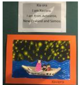
Xaviera Rm 1

Take a look at our display in the cloak bay outside Rm 1.