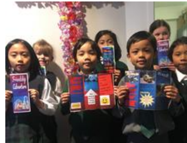
Rm 5 making fancy brochures.