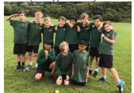
Year 5/6 Boys' cricket team