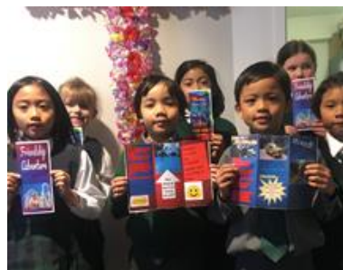
Rm 5 making fancy brochures.