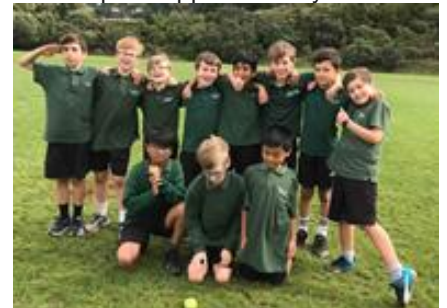
Year 5/6 Boys' cricket team