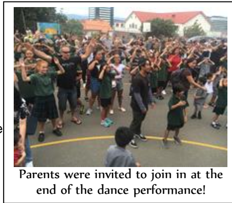
Parents were invited to join in at the end of the dance performance!

Dance In Schools: We had a fantastic celebration session on Friday with families. Starting the year with two intensive weeks of dance lessons has really set the children up for an extremely positive start. Learning to dance requires so many skills like listening, following instructions and directional skills. This kinaesthetic form of learning really encourages students to have confidence in their own ability. As a staff, we were amazed at the complexity of what the children were able to process and put into action. Participation in this programme has been paid for by your generous school donation.