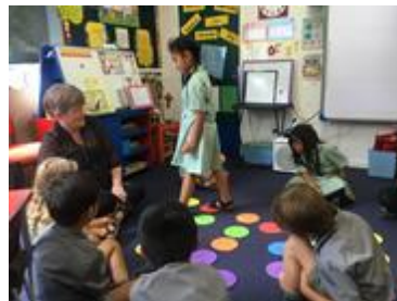
Maths in Rm 1