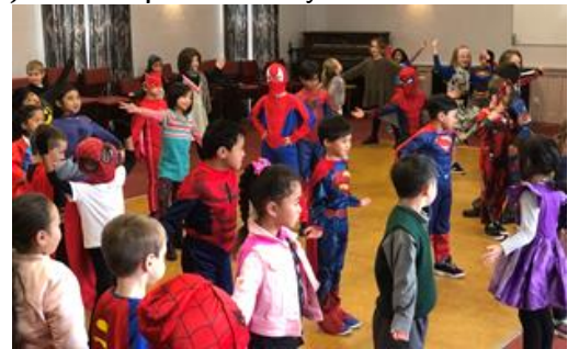
Juniors Super Hero Day:

however when you bring your Junior Rangers to Pukaha you can enjoy a FREE coffee in our Wild Café and go and enjoy a walk around the park for half-price while waiting for the Junior Rangers to come off duty. Pukaha is now offering a separate programme for 10-14 year olds- Te kakanau-the seed, will be offered on Wednesday 11-3pm of the first week and Tuesday 11-3pm of the second week. This programme takes it up a notch for your older, keen kid conservationist and starts to explore tracking, trapping and restoration at a more advanced level. All the usual behind the scenes ranger fun will still be part of this awesome day. $20 per day. They are required to bring their own lunch and the right outdoor gear as this programme runs rain or shine. Spaces are limited and bookings are essential. Book now at info@pukaha.org.nz or give us a call on 06 375 8004