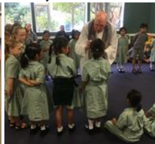
Love Jesus in your life