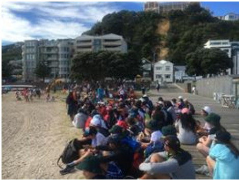
School Beach Day

"I thought it was quite cool! I like being in the sun. I wish there had been a 3 rd swim session!" Noah Rm 9