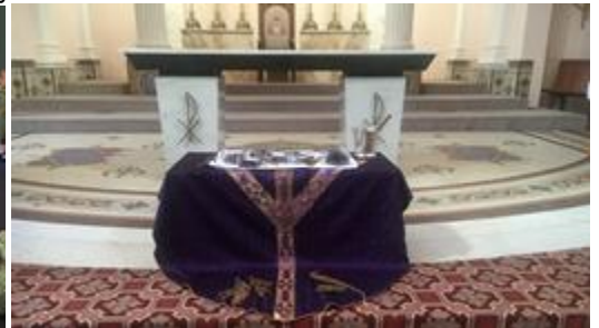
Senior Liturgy Ashes on the altar

Have a fantastic week! I look forward to seeing families at wheels night on Friday