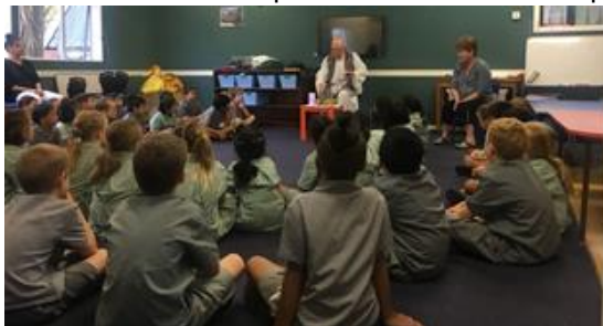
Junior School Liturgy for Ash Wednesday

Today the students all participated in an Ash Wednesday liturgy. Ash Wednesday derives its name from the blessing of ashes made from palm branches from the previous year's Palm Sunday.